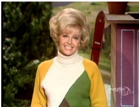
Norma (Larsen) Zimmer sang on TV as Lawrence Welk's "champagne lady" for 20 years, after growing up in Tacoma and Seattle.

Note skis in background!