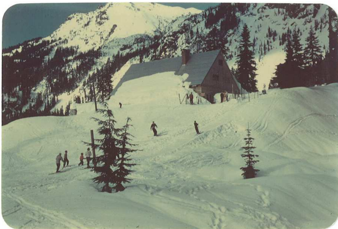
Wayman family photo of skiers in front of the Sahalie lodge in the late 1950s. Note the size of the “original” post-WWII lodge, with a small rope tow running from down near the current Alpental Road (there was no road back then) up toward the kitchen corner.