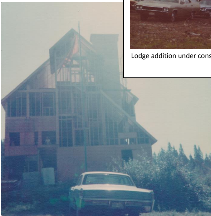
Lodge addition under construction, July/August 1975.