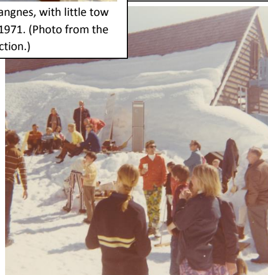
Carnival, April 1971.