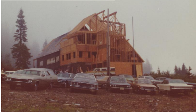
Lodge addition under construction, July/August 1975.