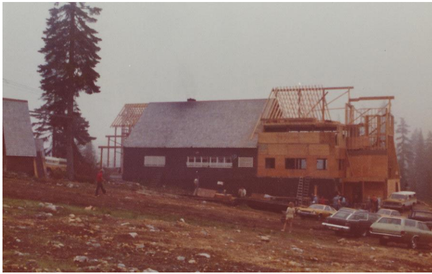
Lodge addition under construction, July/August 1975.