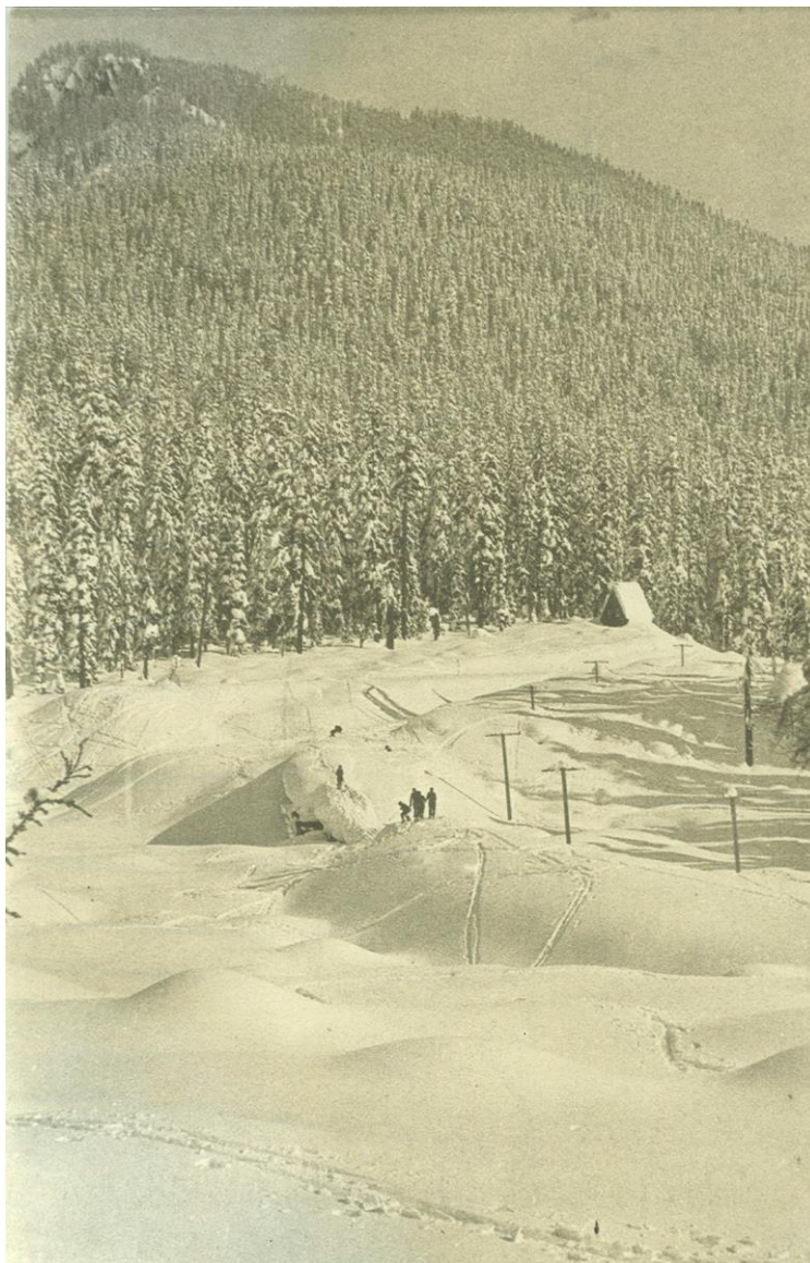
Photo of the partially-built Commonwealth Ski Club lodge in December, 1931, or early winter, 1932.

Take a deep look at this photo and tell me if you can place it in the Sahalie locale.