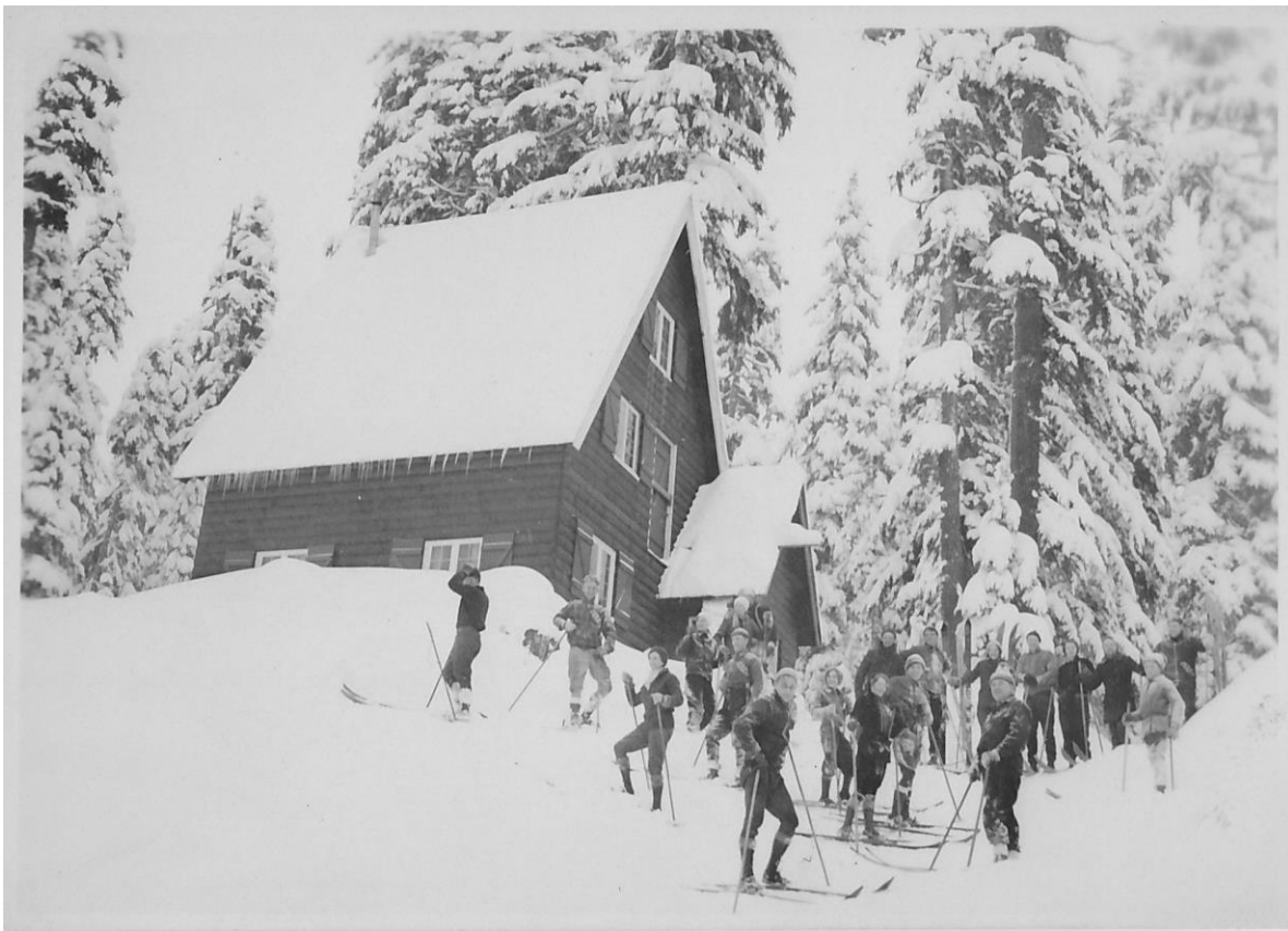
The original/partially-built lodge in late 1931 or early 1932. The major portion of the original lodge was added on to the left in the summer of 1932.

First, here is another photo from the Carl Mahnken archives that shows this small lodge as of the winter of 1931/'32.